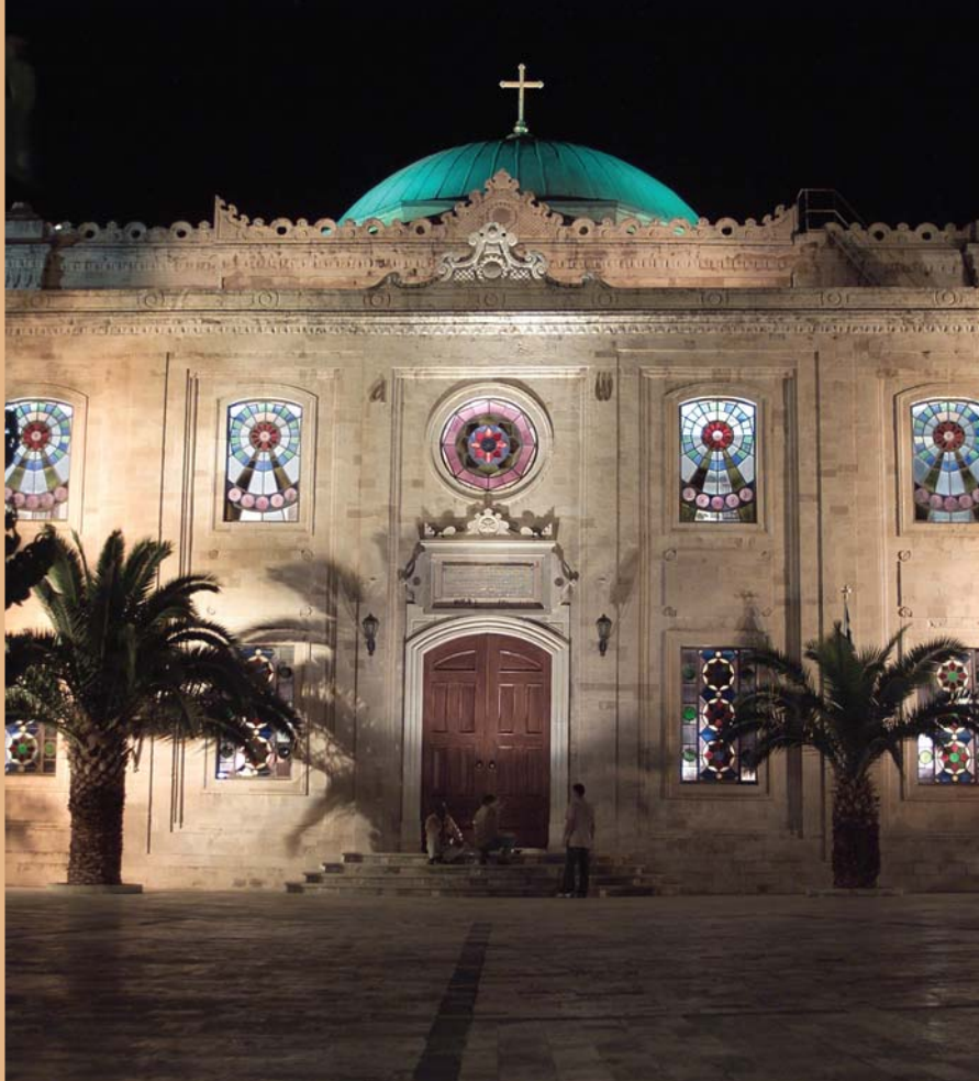
Agios Titos - Heraklion 2004

effective means against neutrality and physical evenness