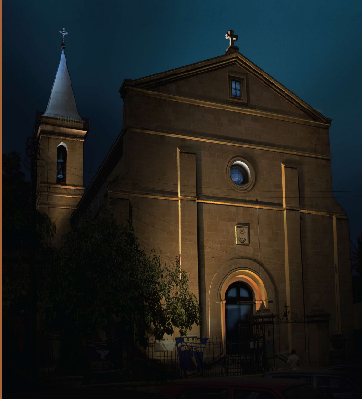
Catholic Church of Holy Cross Nicosia

isn't it better to imagine lighting design than to leave it to chance?